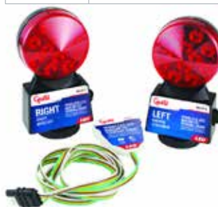
LED Wireless Magnetic Towing Kit 99131-5