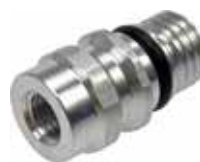
GM Air Conditioning Schrader Valve M12 X 1.50 800-955