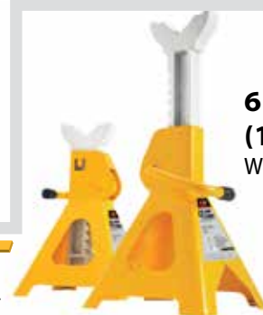
6 Ton Jack Stands (1 pair) W41023