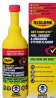
Fuel, Exhaust & Emissions System Cleaner 34720 - 500ml