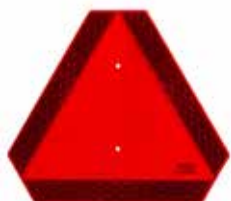
Slow-Moving Vehicle Emblems 71152