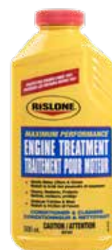
Rislone Engine Treatment 34102 - 500ml