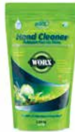
Biodegradable Hand Cleaner 11-1224 - 1.85oz (52.5g)