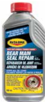
Rear Main Seal Repair 34240 - 500ml