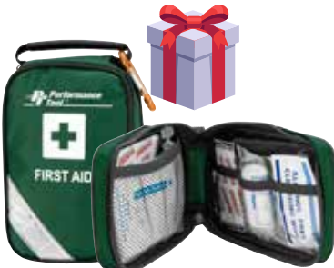
Handyman First Aid Kit W1554