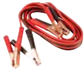
Battery Jumper Cables 10GA 12' W1670