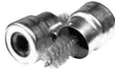
Metal Battery Terminal Brush W147C