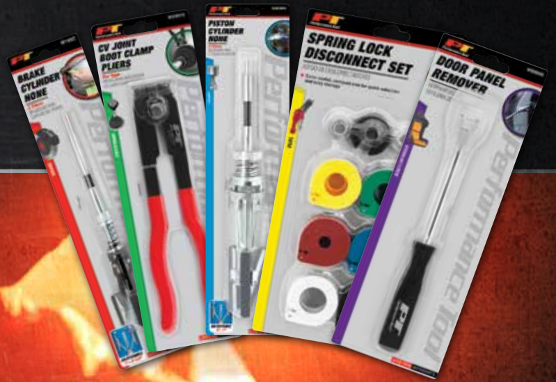
PROFESSIONAL HAND TOOLS