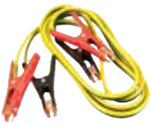
8GA 12' W1671