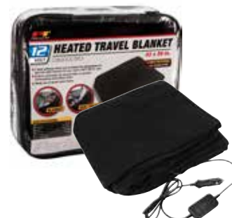
12V Heated Travel Blanket W6049