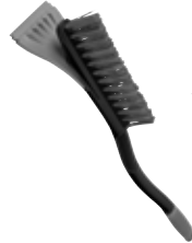
24" Snow Brush/Ice Scraper W1461