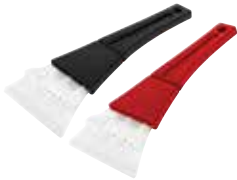
Ice Scraper W9197