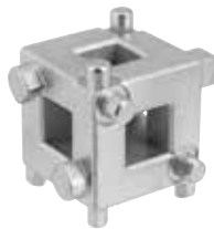
3/8" Dr. Disc Brake Caliper Piston Tool W80621