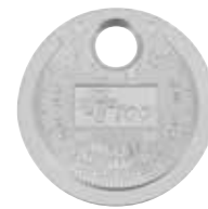
Spark Plug Gapper W3204