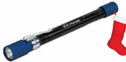
70+LM Penlight 20202 Product Features