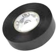
Black Electrical Tape 3/4" x 60' W502