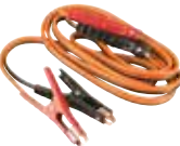
6GA 16' W1672