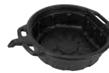
4-1/2 Gallon Oil Drain Pan W4071