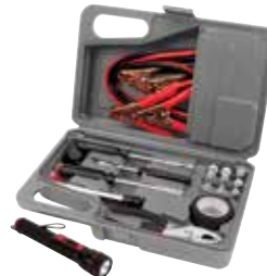
Roadside Safety Tool Kit W1556

12 Volt 150 PSI tire inflator, 8ft 10GA jumper cables for light autos, free standing warning triangle. Also includes, flashlight, slip joint pliers, bungee cords, screwdriver, gloves, snap blade knife, rain poncho, tire gauge, electrical tape and cable ties.