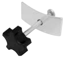
Disc Brake Pad Spreader W209