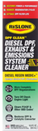
DPF Clean Diesel DPF Exhaust Emissions Cleaner , 500ml 34744