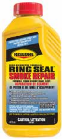
RING SEAL Smoke Repair , 473ml 34416