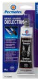
Dielectric Tune-up Grease 22064 - 85g Carded Tube