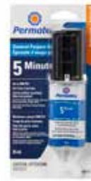
5 Minute Clear Epoxy 84111 - 25mL Carded Syringe