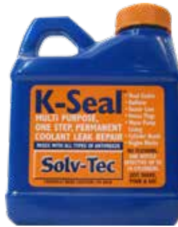
K-Seal™ ST9501 K-Seal is a one-step permanent multi-purpose system for coolant leak repair.