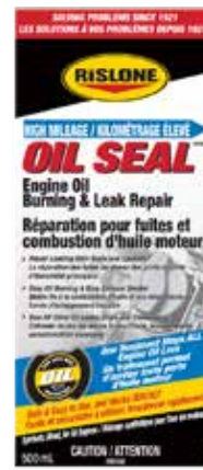
OIL SEAL Engine Oil Burning & Leak Repair , 500ml 34235