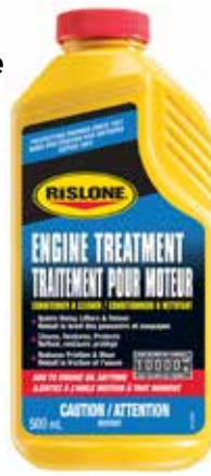
ENGINE TREATMENT Concentrate , 500ml 34102