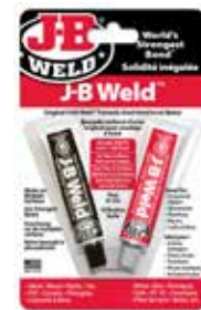
J-B Weld 8265SCAN World's finest cold-weld compound.