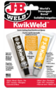
J-B KwikWeld 8276CAN Quick setting steel reinforced epoxy

Includes: One Gallon of Herculiner Ready-to-use Protective Coating Application Brush for Tight Spots and Corners Two Rollers for Easy/Even Application One Roller Handle