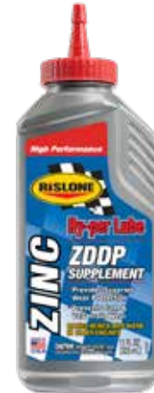
Hy-Per Lube Zinc ZDDP Supplement , 325ml 34405