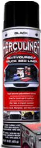
Aerosol Truck Bed Coating HALB15CAN

The tough, textured polyurethane formula is chip-, fade- and impact-resistant, and adheres to metal, fiberglass, wood and numerous other surfaces. The spray is great for touch-ups, cutting in before applying roll-on Herculiner, or protecting hard-to-reach areas like undercoatings and wheel wells. From front grills to back bumpers and any surface in-between, Herculiner provides permanent protection to keep things watertight and rust free.