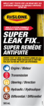
Super Leak Fix 34305 - 500ml