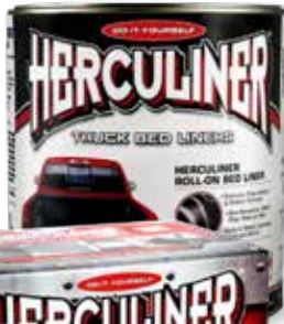
Original Roll-On Bed Liner Gallon HCL1B3CAN