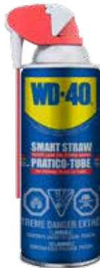
SMART STRAW Multi-Use 325g 01272