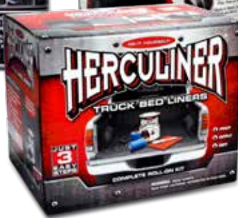
Original Roll-On Bed Liner Kit HCL1B8CAN

Includes: One Gallon of Herculiner Ready-to-use Protective Coating Application Brush for Tight Spots and Corners Two Rollers for Easy/Even Application One Roller Handle