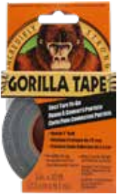
Gorilla Tape To-Go 6101002 - 30 feet