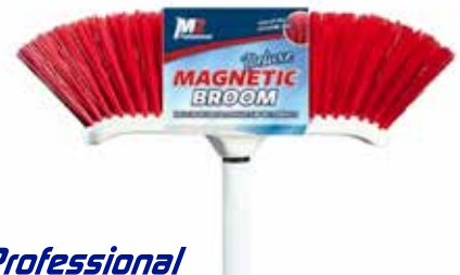
Venus Curved Magnetic Broom with 48" Metal Handle BM-4200