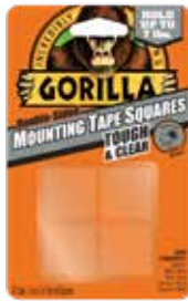
Mounting Tape 6069301 24 1x1 inch squares