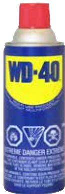
WD-40® Multi-Use 311g 01111