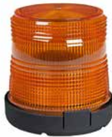
Amber LED Class II Compact Base - Perm Mount 79183