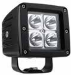
4800 Raw Lumens, Small Cube BZ221-5