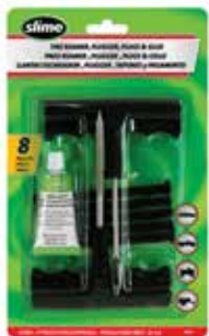
Reamer/Plunger Kit T Handle 24011