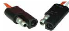
16G 12" Lead Trailer Cables 1871-BP - 2 Pins