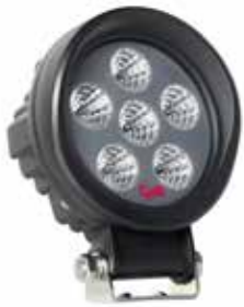
Brite Zone™ Round LED Work Lamp BZ101-5 1600 Effective Lumens