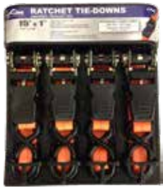
15'x1" General Purpose Ratchet w/Padded Handle SL91 - 4 pack