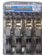
95005 - 4 pack