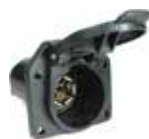
9483BP Trailer socket