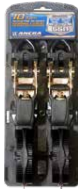
Strap Assembly - 1" Ratchet Buckle-10' w/vinyl S-Hooks 95002 - 2 pack