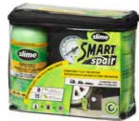
Smart Spair, Emergency Tire Repair Kit 50057