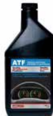
Q.A.P Synthetic LV Multi-Vehicle ATF FX0002415 946ml