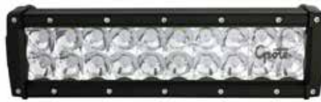
12" Light Bar 64J11 Combination Flood/Spot, 12V/24V