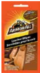
Leather Wipes 18451 2/pack