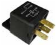
General Purpose Relay 925-11 40/30A 12V DC 923-11 40/30A 24V DC