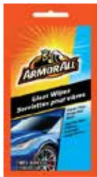
Glass Wipes 18452 2/pack