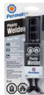
Plastic Welder 84126 25ml carded syringe, black