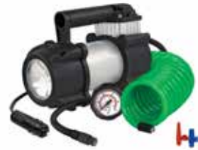
Heavy Duty Tire Inflator 42007