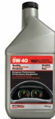
QAP Synthetic 5W40 FX0001606 946ml