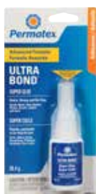
Ultra Bond 49512 - 28g Carded Bottle