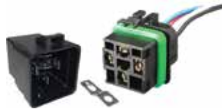
Sealed Relay & Pigtail Combo-Pack 928-91 40/30A 12V DC