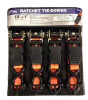
15'x1" General Purpose Ratchet w/Padded Handle SL91 - 4 pack