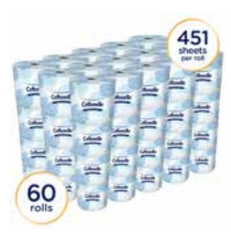
Cottonelle® Professional Standard Roll Toilet Paper 17713