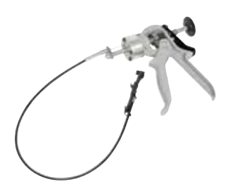
Flexible Hose Clamp Tool