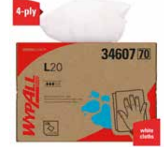
WYPALL® GENERAL CLEAN L20 Medium Cleaning Cloths 34607