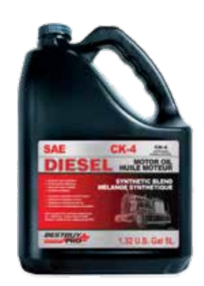
Bestbuy Pro Synthetic 5W-40 CK-4 FX0004030