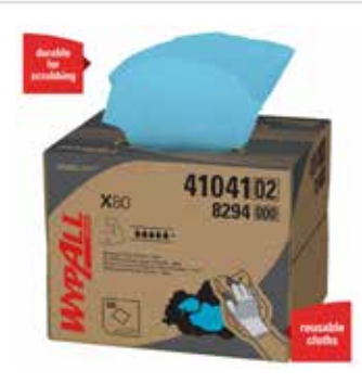
WYPALL* SHOPPRO* X80 Shop Towels 41041