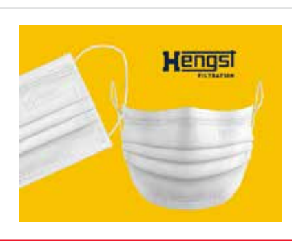
3-Layer Breathing Masks Box of 50 MNS01