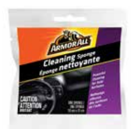
Cleaning Sponge 19078