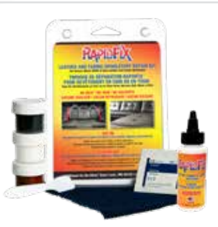
Leather and Fabric Upholstery Repair Kit 8121300-EF No heat, iron or solvents.