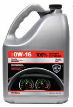
QAP Synthetic 0W16 5L FX0004830 Sold by case of 4