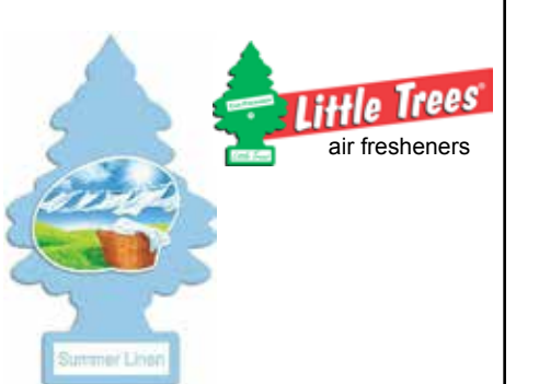
Summer Linen U1P-10574