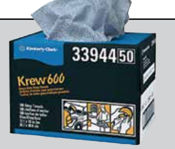
KREW 600 Heavy- Duty Shop Towels 33944