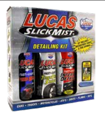
SlickMist Fast and Easy Detailing Kit 20558