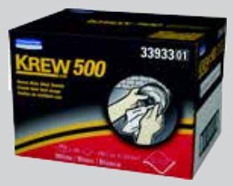
KREW 500 Shop Towels 33933 Twin Pop Up Box