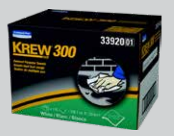
KREW 300 Wipers 33920