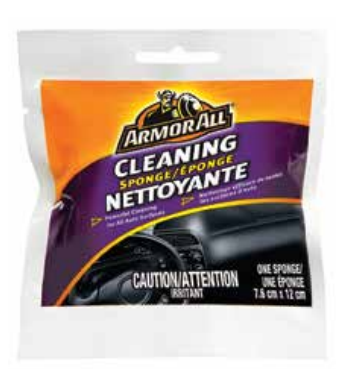
Cleaning Sponge 17575