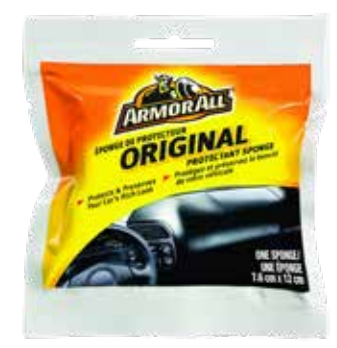
Original Protectant Sponge 17574