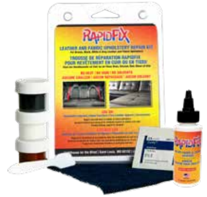
Leather and Fabric Upholstery Repair Kit 8121300-EF No heat, iron or solvents.