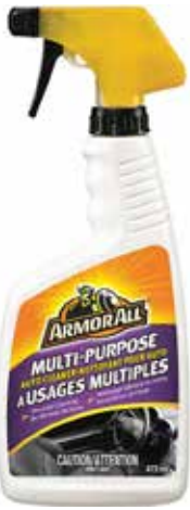
Multi Purpose Cleaner 11068 473ml