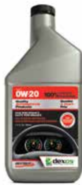
QAP Synthetic 0W20 FX0004606 946ml