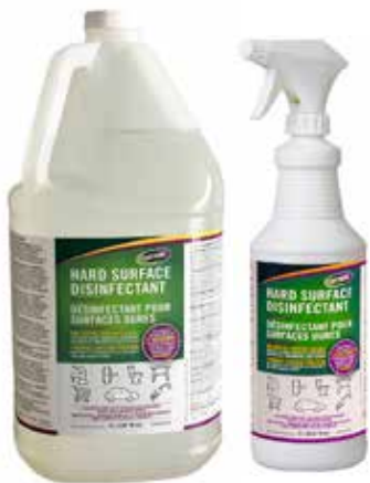
Hard Surface Disinfectant 20201 1L