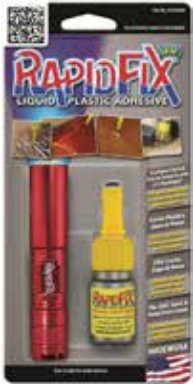
RapidFix UV with Flashlight 6121805EF - 10ml Amazing liquid plastic adhesive that only sets when exposed to UV light