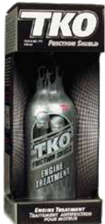
TKO™ Friction Shield Engine Treatment

777 - 475ml Reduces friction, oil acidity and wear in gas or diesel engines. Forms a strong lubricating shield to reduce metal to metal contact. Improves compression and makes engine start up smoother.