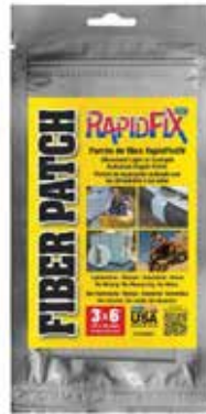
UV Resistant Fiber Repair Patch 6121936EF - 3x6" Easy-to-use ultraviolet light or sunlight activated, self-adhesive repair patch.