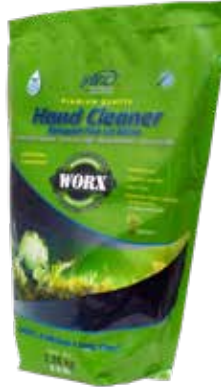
Biodegradable Hand Cleaner 11-2300 3lb

Sustainable Pouch Packaging 950 Hand Washes in Every Bottle The new Stand-up Pouch Packaging goes a step further in reducing the CO2 Emissions, carbon footprint, and increasing the savings in storage space and end of life disposal!