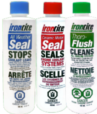
All Weather Seal 9132-16 - 1 pint

777 - 475ml Reduces friction, oil acidity and wear in gas or diesel engines. Forms a strong lubricating shield to reduce metal to metal contact. Improves compression and makes engine start up smoother.