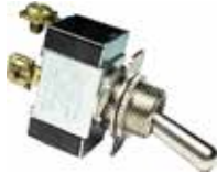
Metal Bat Handle SPST Switch 9435BP