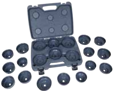
H.D. End Cap Wrench Set, 21 pieces 61460