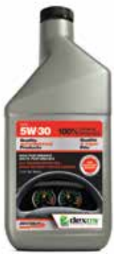
QAP Synthetic 5W30 FX0004706 946ml