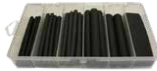
Black Wall Shrink Tube Assortments Includes inside diameters 1/8", 3/16", 1/4", 3/8", 1/2", 3/4" 67-91 3:1 DUAL 57-91 2:1 SINGLE