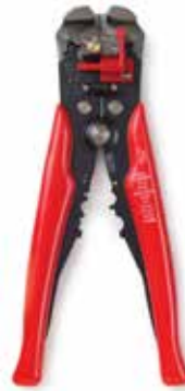
Heavy Duty Wire Stripper, Cutter & Crimping Tool 83-6512