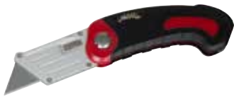
Quick Release Utility Knife 83580