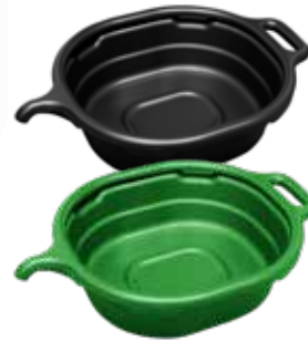
Oval Drain Pan 4.5 Gallon 17972 - Black 17982 - Green