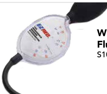
Windshield Washer Fluid Hydrometer S104