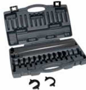
Inner Tie Rod Tool Set, 12 Pieces 58100