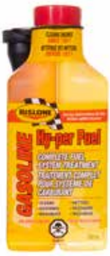
Gasoline Fuel System Treatment 34700 - 500ml