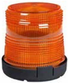
Compact LED Beacon Amber 12-24V Low Lens 79093