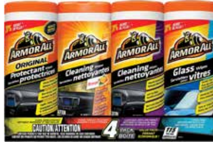
Wipe Multipack 10881 115 wipes