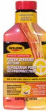
Rislone Power Steering Repair 34650 - 500ml