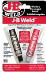
J-B Weld 8265SCAN World's finest cold-weld compound.