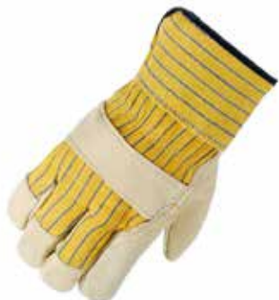
Cowhide Work Gloves 021600PLPP