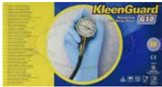
Kleenguard Blue Nitrile Gloves 57372 M 100/box 57373 L 100/box 57374 XL 90/box