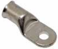
4 AWG Plated Tubular Lug Rings 4238PR - 5/16" 4239PR - 3/8"