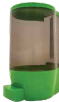
Easy-Fill Dispenser 11-9997