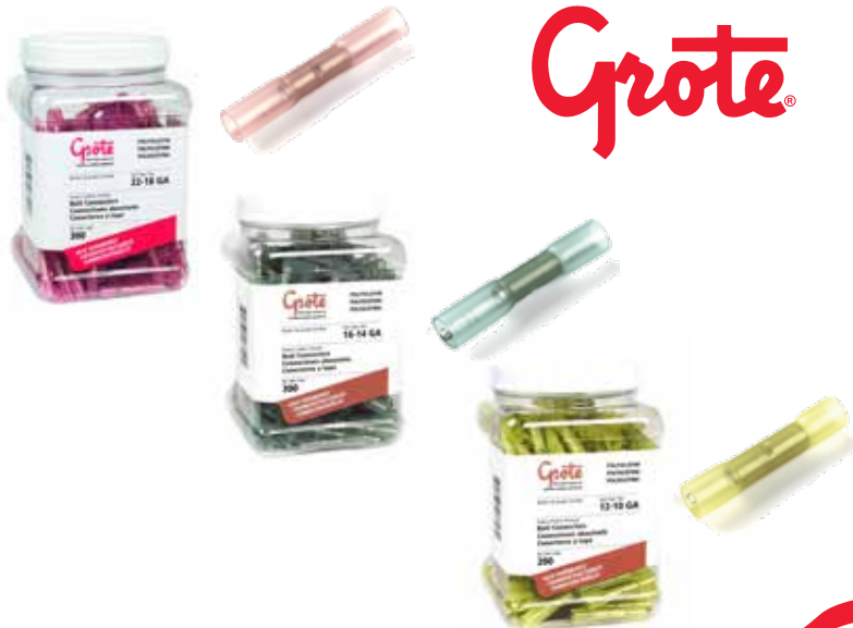
Heat Shrinkable Butt Connectors - Polyolefin

22-18 GA 83-3150-3 (300/jar) 83-3150 (100/pack)