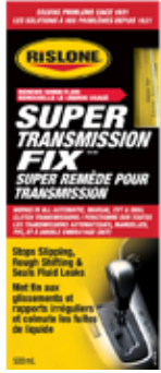
Super Transmission Fix 34516 - 500ml