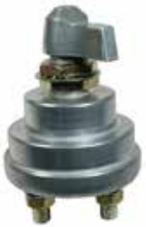
UL 588 Heavy Duty Master Battery Disconnect 9449-11