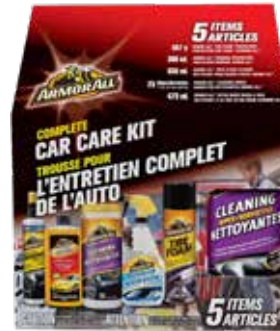
Complete Car Care 5pc Kit 18378 Tire Foam Protectant Ultra Shine Wash and Wax Original Protectant Cleaning Wipes Auto Glass Cleaner