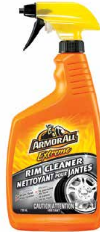
Rim Cleaner 40340 710ml