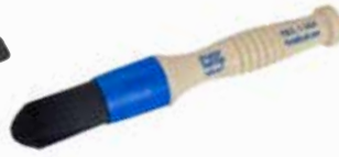
Parts Brush™ Atlasta® Soft Brush 89510