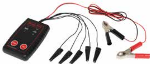
Relay Pro® 12-24V Relay Tester 60150