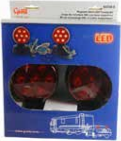
Magnetic LED Towing Kit - Red 65720-5