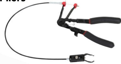
Button Connector Pliers 35070