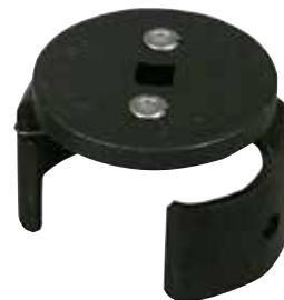
Import Car Filter Wrench 63600