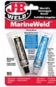
MarineWeld 8272CAN Waterproof when fully cured.