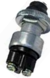
Heavy Duty Push Button/Horn 9452-11