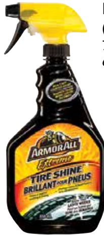
Extreme Tire Shine (Spray) 78026 650ml