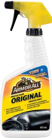
Original Protectant 78021 473ml