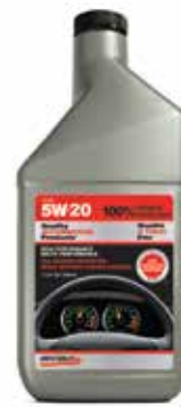
QAP Synthetic 5W20 FX0004506 946ml