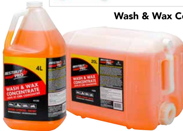
Wash & Wax Concentrate