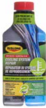
Cooling System Repair 31150 - 500ml