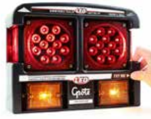
Submersible LED Trailer Lighting Kit 65330-5 Popular Square Design