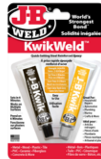
J-B KwikWeld 8276CAN Quick setting steel reinforced epoxy