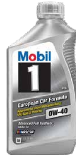
European Car Formula MOBIL0W40