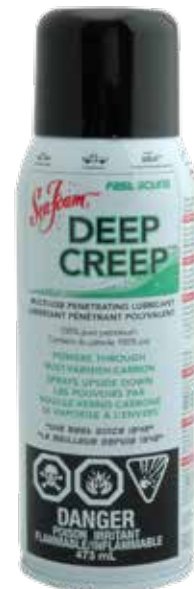
Deep Creep DC-14 (473ml)