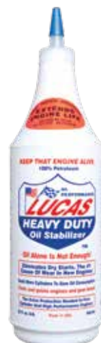
Heavy Duty Oil Stabilizer 20001