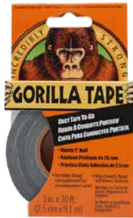
Gorilla Tape To-Go 6101002 - 30 feet