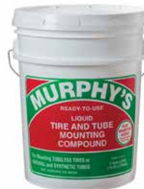
Liquid Tire and Tube Mounting Compound