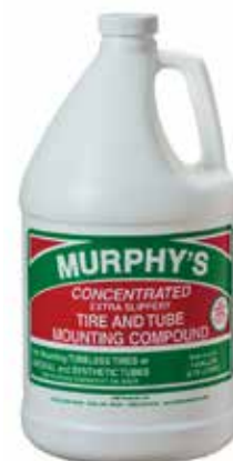
Concentrated Extra Slippery Tire And Tube Mounting Compound 1950 1 gallon