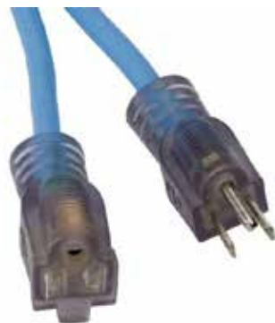
Cold Weather Extension Cord w/Single Lighted Outlet - 13amp SL-991 - 50 feet