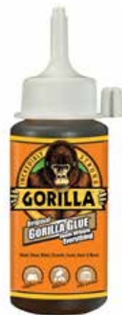
Original Gorilla Glue 5100402 - 4oz