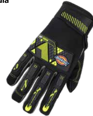
Impact Performance Gloves Dickies