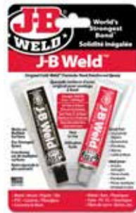
J-B Weld 8265SCAN World's finest cold-weld compound.