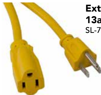
Extension Cord w/Single Outlet - 13amp SL-750 - 50 feet