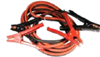
6 Gauge 400 Amp 12' 8164E