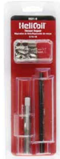
5/16-18" Coarse Thread Repair Kit 5521-5