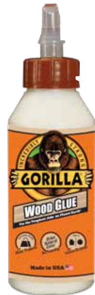
Gorilla Wood Glue 6200201 - 8oz