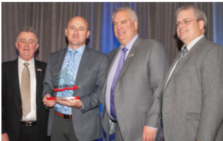
The Marketing Partner Award was presented to Baldwin Filters

Other paramount vendor award categories announced: The Marketing Partner Award was presented to Baldwin Filters, the Rising Star Award was received by Magnacharge, the Bestbuy Partner Award recipient was Vision-OE/NuGeon and the Cornerstone Award went to ProMax.