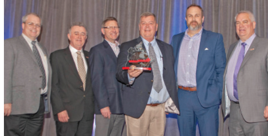
Vision-OE/NuGeon received the Bestbuy Partner Award