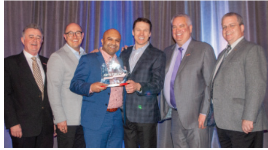
Magnacharge received the Rising Star Award