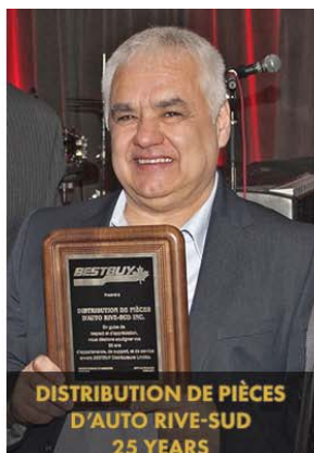
DISTRIBUTION DE PIÈCES D'AUTO RIVE-SUD 25 YEARS