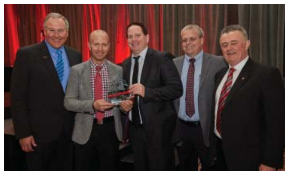
Spectra Premium Industries accepts the Bestbuy Partner Award.