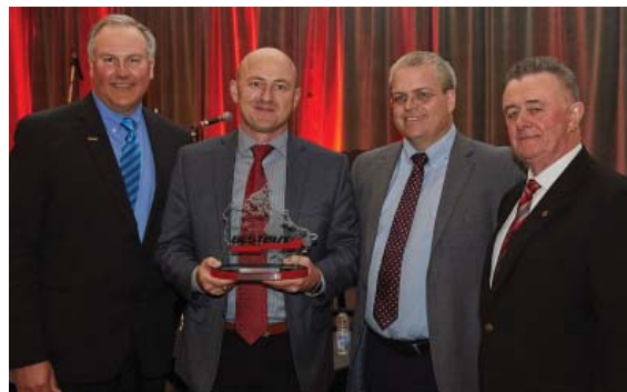
Baldwin Filters accepts the Rising Star Award.