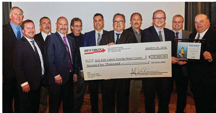
Presenting the cheque to the Sick Kids Family Heart Centre