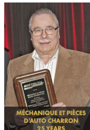
MÉCANIQUE ET PIÈCES D'AUTO CHARRON 25 YEARS

Not shown: Raco Auto Supply, 30 years; Les Pièces GR, 20 years; Gregg Distributors, 20 years; Pièces D'Auto Guy, 20 years; and Patterson's Parts Supply, 10 years.