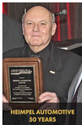
HEIMPEL AUTOMOTIVE 50 YEARS