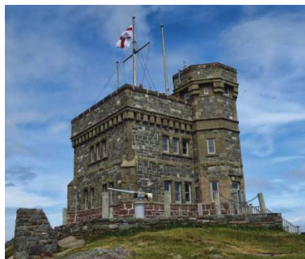
Cabot Tower atop Signal Hill

Hike up nearby Signal Hill through the Battery, where tiny colourful wooden homes cling valiantly to cliff-sides ravaged by ocean waves. The hill is home to the unmistakable, iconic Cabot Tower, a castle-like structure built to commemorate the 400th anniversary of John Cabot's discovery of Newfoundland. It was here that Marconi famously received the first transatlantic wireless message in 1901. From Cabot Tower you can look out over the cliffs and harbour to see a captivating skyline.