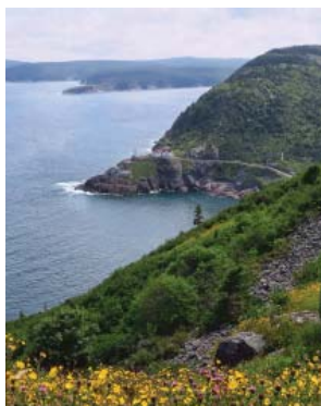
View from Signal Hill

As you explore the city you will stroll along some of the oldest streets in the New World, and visit the many shops, boutiques, lively pubs, cafés, and unique art galleries.