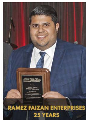
RAMEZ FAIZAN ENTERPRISES 25 YEARS