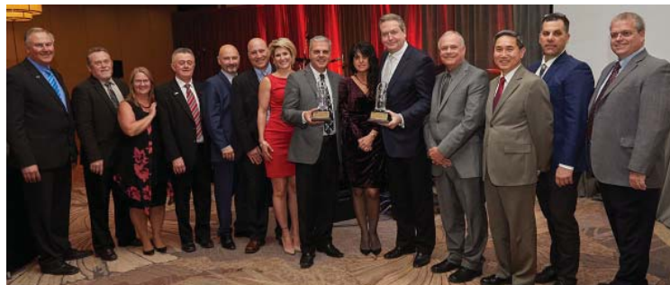
Above: Federal- Mogul Motorparts accepts the William Elton Award.