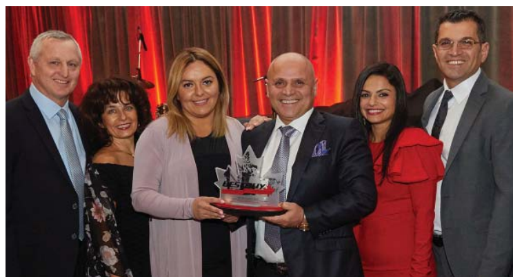
ProMax accepts the Horace J. Pratt award.

ProMax (Auto Parts Depot) was the recipient of the prestigious Horace J. Pratt 2017 Vendor of the Year in recognition of their excellence in service, sales performance and support as voted by the Bestbuy members. ProMax has received this award for the fourth straight year since 2014, and previously in 2010.