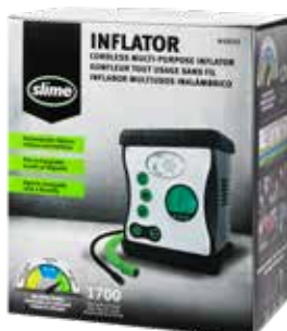
Cordless Multi-purpose Inflator 42013 Rechargeable battery Inflates and deflates