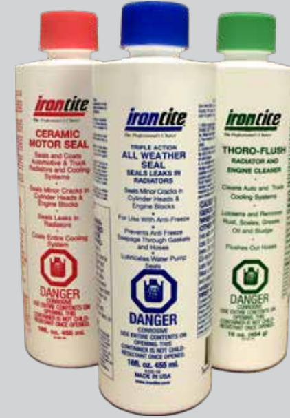
ALL WEATHER SEAL 9132-16 - 1 pint