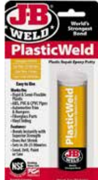
Kwik Plastic Epoxy 8237F