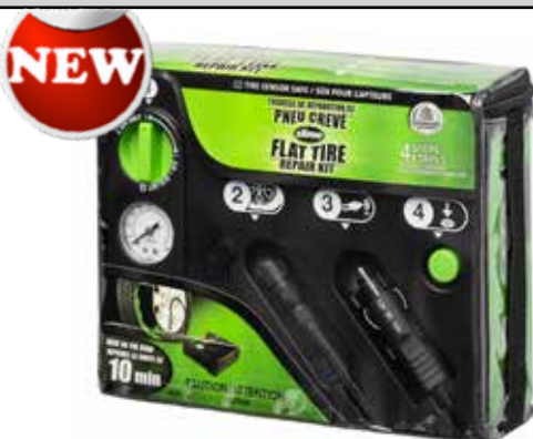
Flat Tire Repair Kit 50133 Repairs & inflates! Tire sensor safe