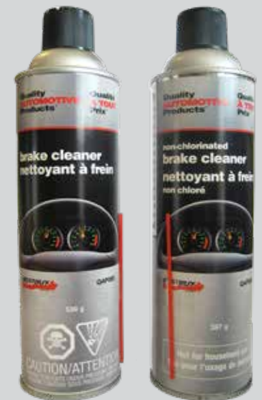
QAP088 - Non-chlorinated 369g