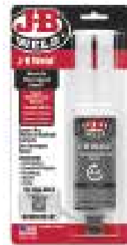
JB Original Syringe 25 ml 50165CAN