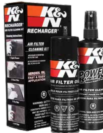
Filter Care Service Kit 99-5000