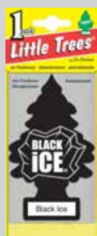
Black Ice U1P-10155