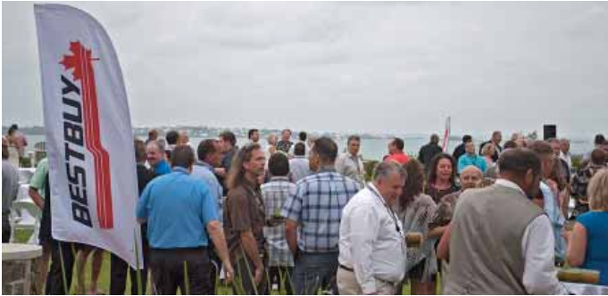
Above: The Great Sound Lawn welcome reception overlooking Bermuda's large ocean inlet.