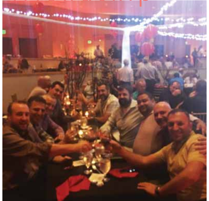
Above: Enjoying the Group Dinner