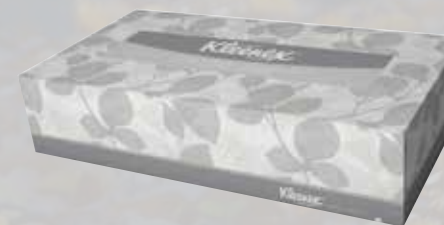
Kleenex® Facial Tissue 21400