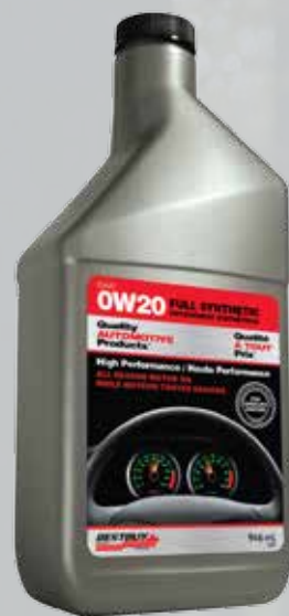
QAP 0W20 Motor Oil Full Synthetic QSYN0W20-1x6 Sold in case of 6