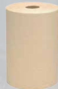
Brown Roll Towels 02021