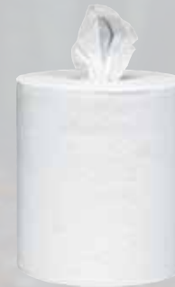
SCOTT® Towels 01010