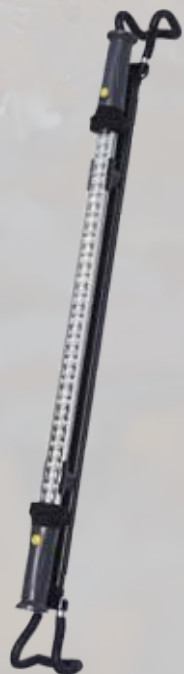
Underhood Light 111036