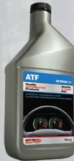
DEXRON 946ml QDEXRON-1 Sold by case of 12