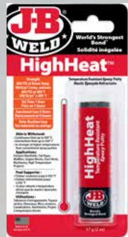
High Heat Epoxy Putty - 2 oz. 8297F