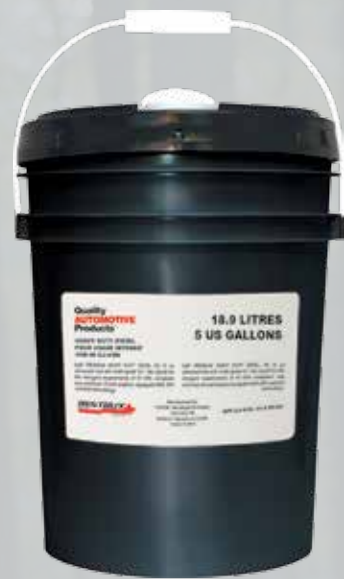
15W40 CJ-CI-4 18.9L Pail Q15W40CJ4-19