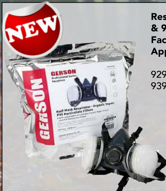
Respirator Starter Kit # 9291 & 9391 Professional Series™ Facepiece Organic Vapor - P95 Approved - Bag