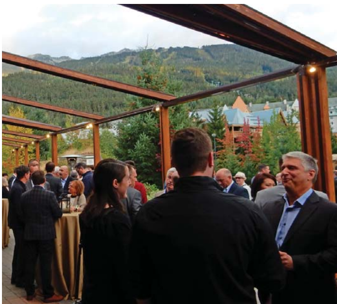
Catching up during cocktails at the Cultural Centre.