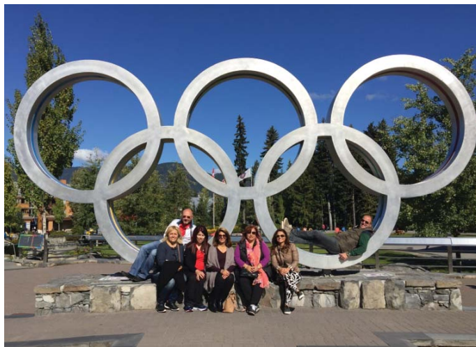
Exploration day in Whistler Village