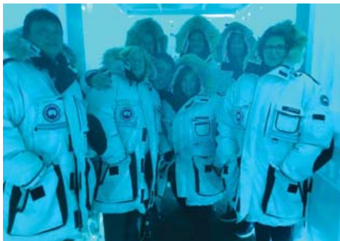
Bundled up for a vodka taste-test in the "ice room" at Bearfoot Bistro.