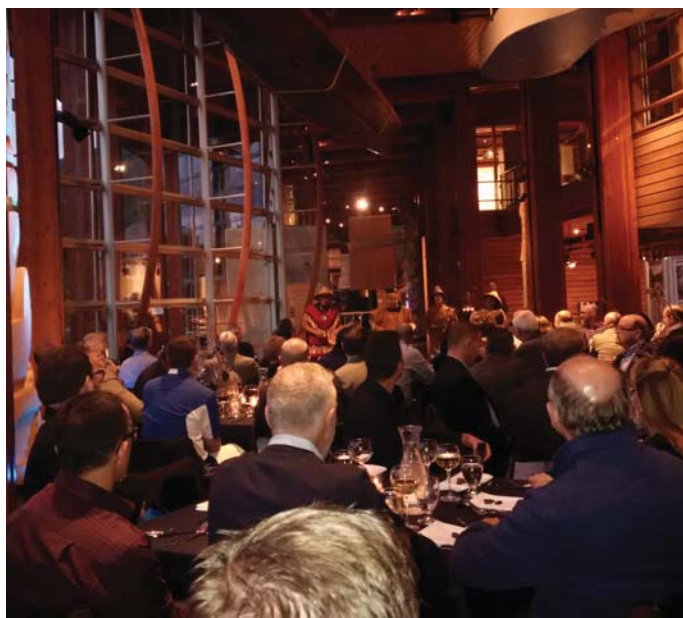
The First Nations blessing before dinner inside the Great Hall.