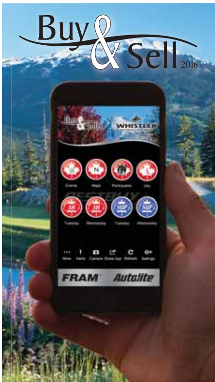
Buy & Sell: Whistler September 18 - 21, 2016

To enhance your experience at Buy & Sell, we've updated our Bestbuy app with Whistler content. You will be able to access GPS destination maps, list of attendees, meeting schedules (coming soon), restaurant options and more!