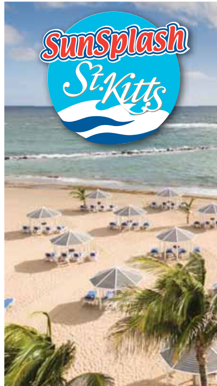
SunSplash: St. Kitts Departure on January 13, 14 or 15, 2017 (Trip duration is 8 days/7 nights.)

New details on the SunSplash 2017 trip to the exquisite Caribbean island of St. Kitts have been added to the website www.sunsplash.ca .