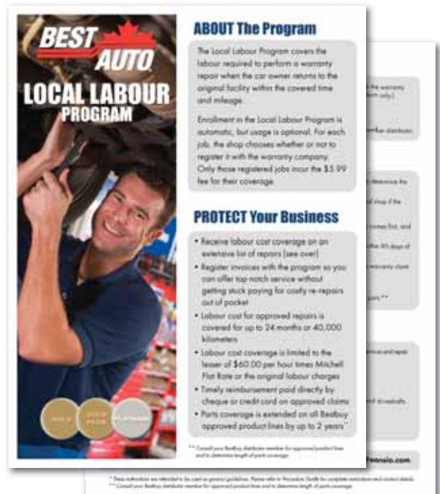
Two new warranty flyers have been added to the Best Auto introduction package and are also available as PDFs.