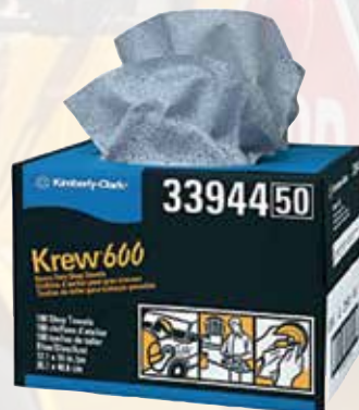
KREW 600 Heavy-Duty Shop Towels 33944