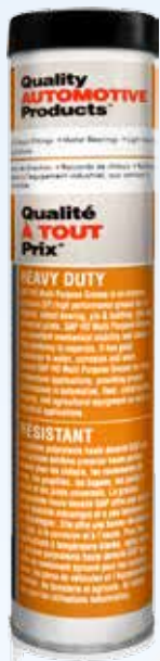
QAP HEAVY DUTY Multi Purpose Grease FXG000111