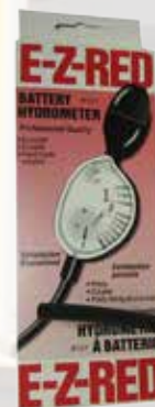
Battery Hydrometer SP101