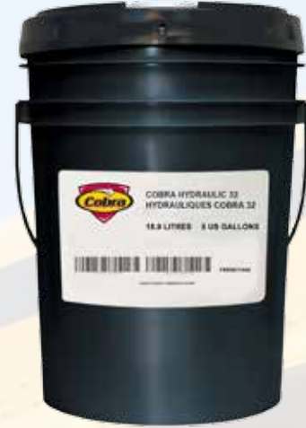
Cobra Hydraulic 32 FBB0011740 18.9L Pail