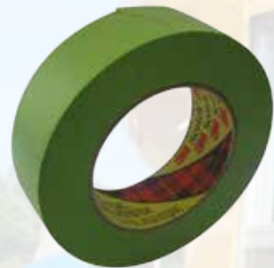
233+ Performance Masking Tape