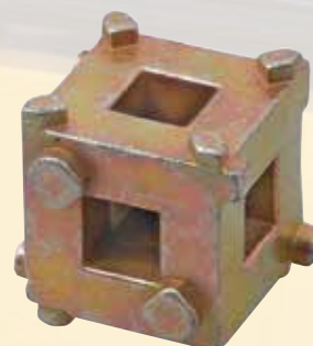
Rear Disc Brake Adjuster 28600