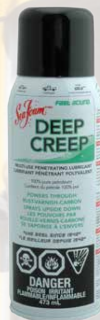
Deep Creep DC-14 (473ml)