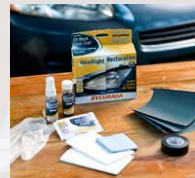
Headlight Restoration Kit 38773