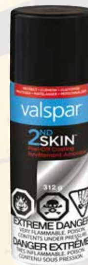
2nd Skin Peel-Off Coating 312g 17200 - Black