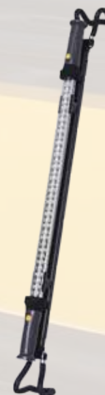
Underhood Light 111036