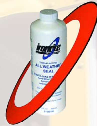
Irontite All Weather Seal 9132-16 Ultimate Fix For Head Gasket Leaks