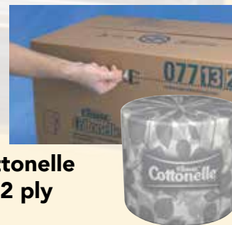
Kleenex Cottonelle bath tissue, 2 ply 17713