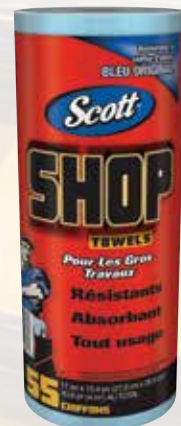
Shop Towels 75120