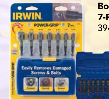
Power-Grip™ Screw and Bolt Extractor Set, 7-Piece 394100