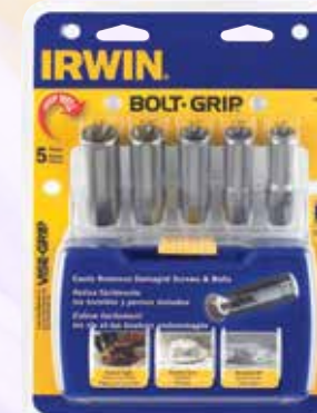
Bolt-Grip Deep Well Set, 5-Piece 3094001