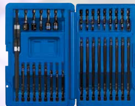
34-Piece Impact Series Automotive Fastener Drive Set 1840391