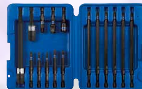
16-Piece Impact Series Automotive Fastener Drive Set 1840320