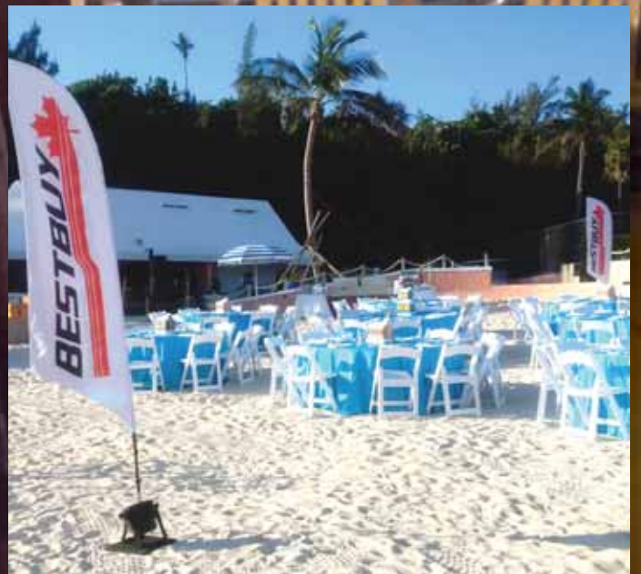
Ooey gooey s'mores! Inset: the Bestbuy flags waving on the beach.

Tuesday evening, the group made their way to the Fairmont beach for a large dinner party. Shareholders and suppliers enjoyed great food and company on Bermuda's famous pink sand. Guests were entertained by a local Bermudian musical duo throughout the evening, and relaxed by a large bonfire on the beach after dinner.