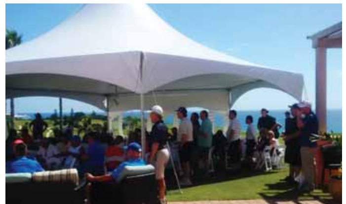
Pictured (two photos): Port Royal Golf Course where attendees enjoyed lunch in the shade.