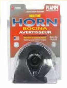
Horn 72012 - Low Tone