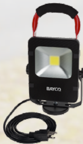
SL-1514 Magnetic Base