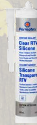
Clear RTV Silicone Adhesive Sealant 59113 300ml