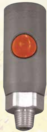
1/4" Male Safety Coupler S-99706 1/4" Male Push Button M Style Safety Coupler (Using 728 Female Plugs)