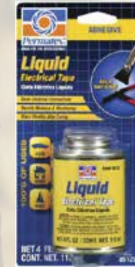
Liquid Electrical Tape 85121