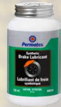
Synthetic Brake Lube 09125 236ml