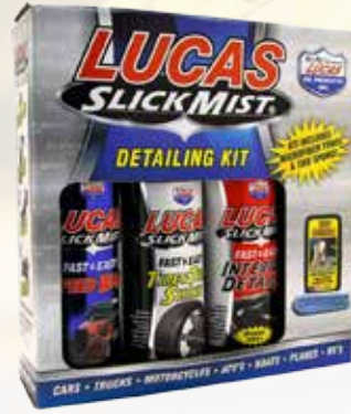
SlickMist Fast and Easy Detailing Kit 20558