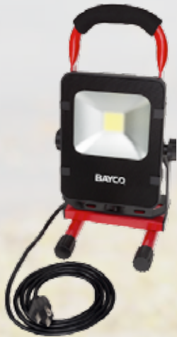
SL-1512 Floor Stand