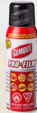
Pro Film® Corrosion Protection & Penetrant 29217 336g