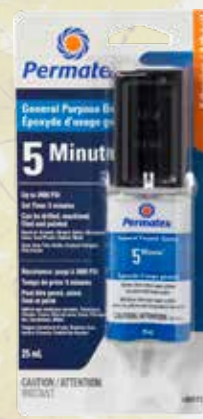
5 Minute General Purpose Epoxy 84111