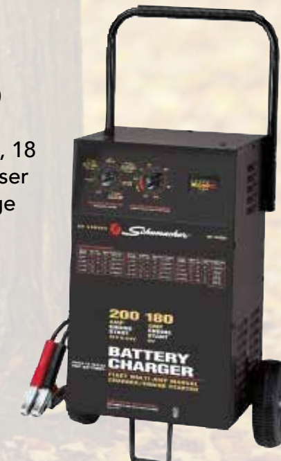
1.5 amp Battery Charger SE-1-12S

Keeps 12 volt batteries charged. Fully automatic