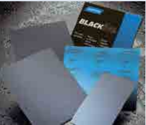
Norton Waterproof Sheets - 9 x 11" 39388