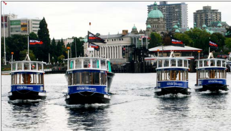
Water Taxis flying Bestbuy flags were seen all day Tuesday zipping around Victoria's inner harbour - transportation arranged for our Group Evening Out.

A memorable Oceanside Buy & Sell took place September 21 – 24, 2014. Beautiful water and mountain vistas followed our group throughout the four-day Victoria event.