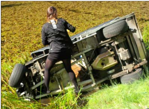
Thankfully, no one was hurt.

Two days of successful meetings with suppliers were highlighted with events such as Bestbuy's annual