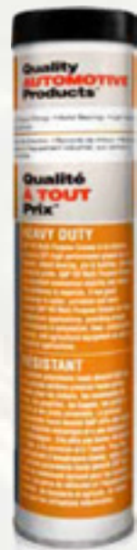
QAP HEAVY DUTY Multi Purpose Grease FXG000111