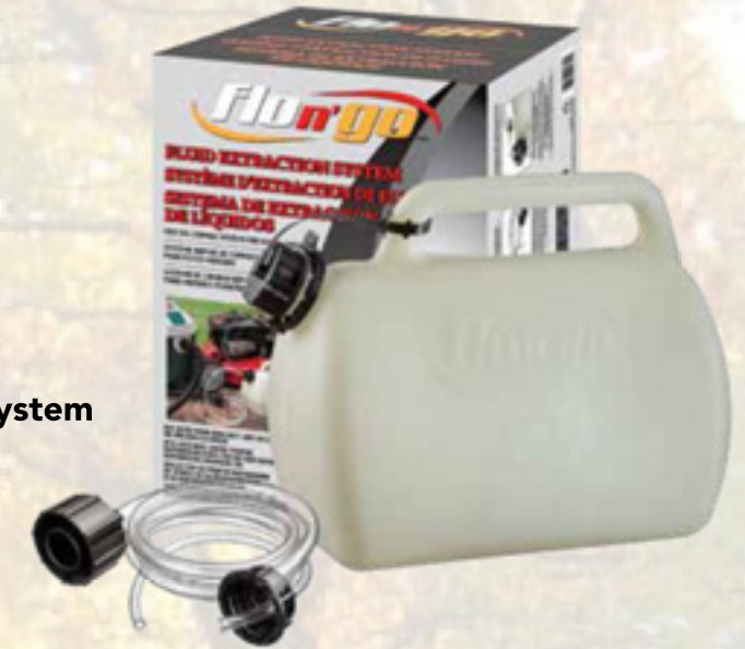
Fluid Extraction System 09644