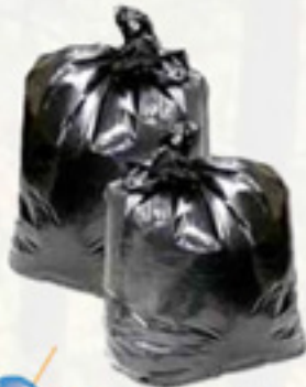
Strong Black Garbage Bags (150) 110-1060 - 35 x 47"