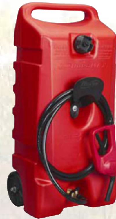
Duramax 53L Gas Caddy 06792