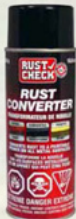
Rust Converter 11006 283g