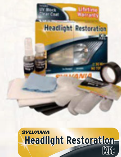
Headlight Restoration Kit 38773