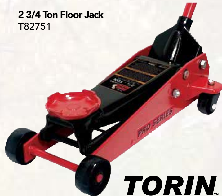
2 3/4 Ton Floor Jack T82751