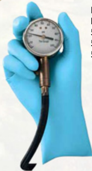
KLEENGUARD G10 Blue Nitrile Powder-Free Gloves 57372 - M 57373 - L 57374 - XL