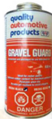
Gravel Guard - 830ml BB304 - Black