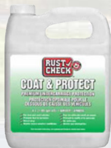
10025 350 g